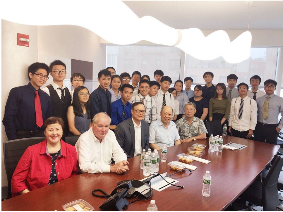
Global Bank Workshop Friday Discussion