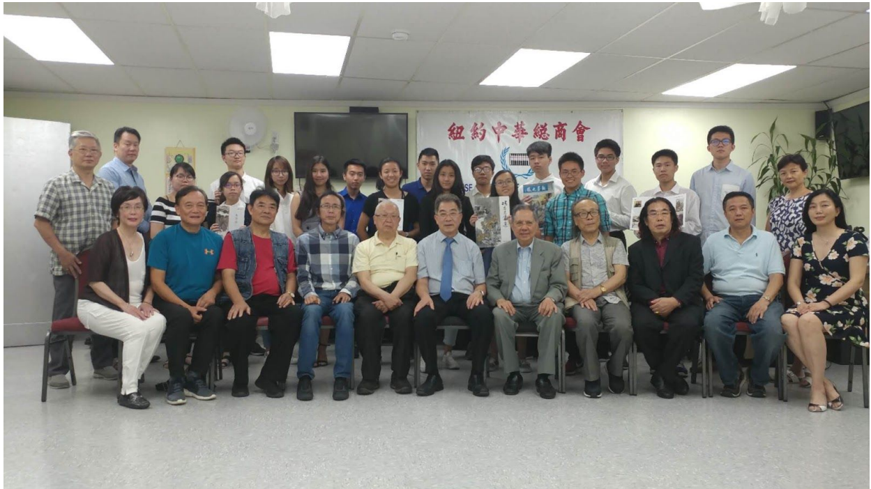
The Elderly Artwork show.