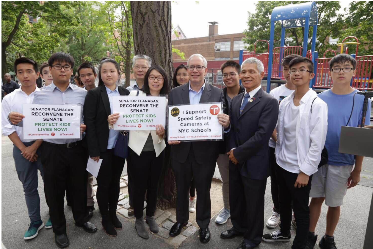
Scott Stringer Rally for Speed Cameras near schools