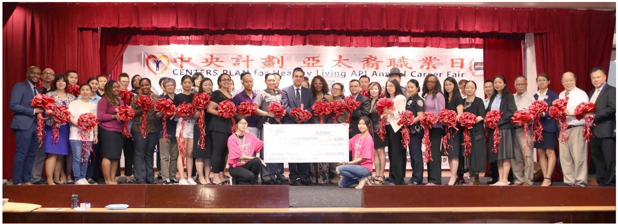
API Career Fair