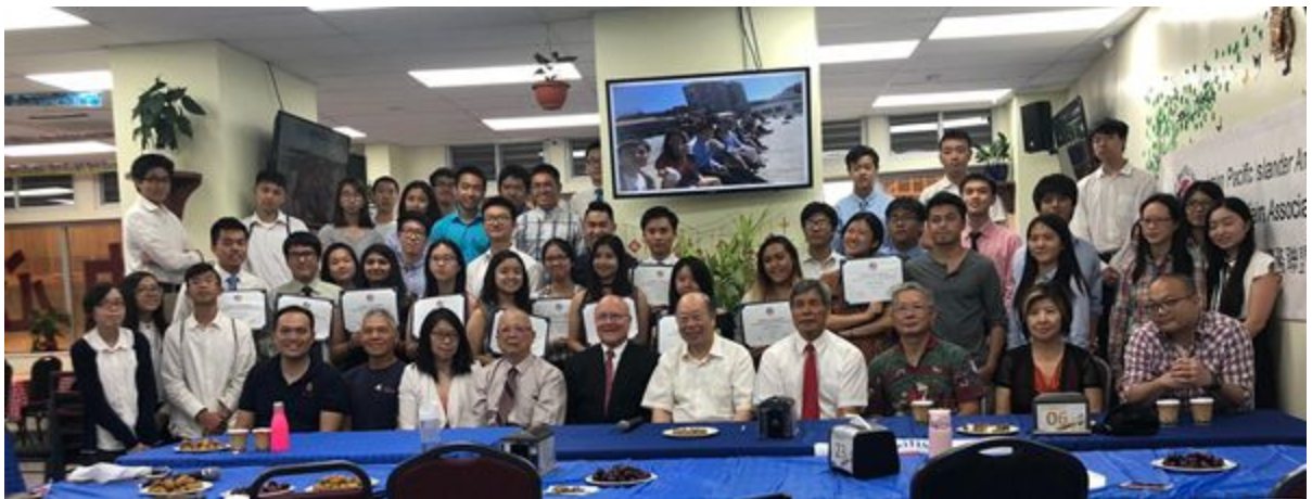
APAPA Interns Graduation