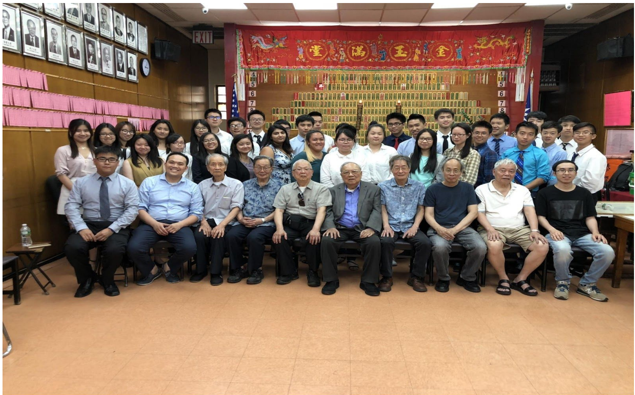
At the Lee Family Association