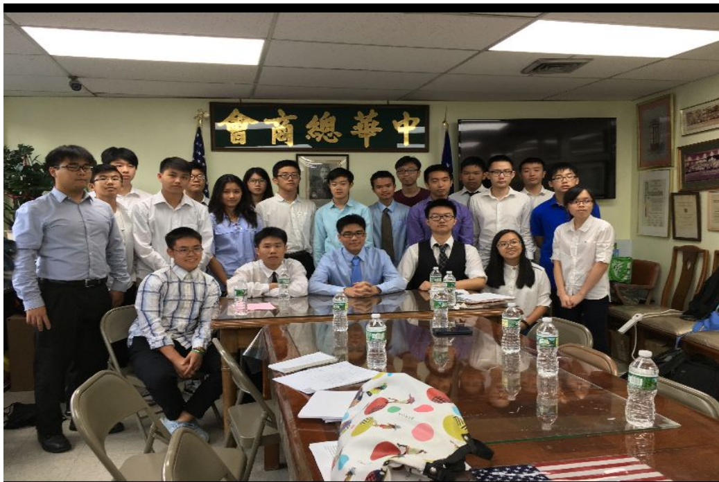
Civic Advocacy Press Conference on the SHSAT bill