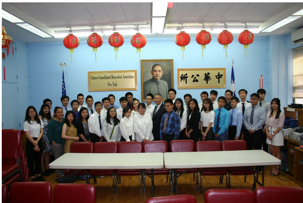
Touring the Chinese School