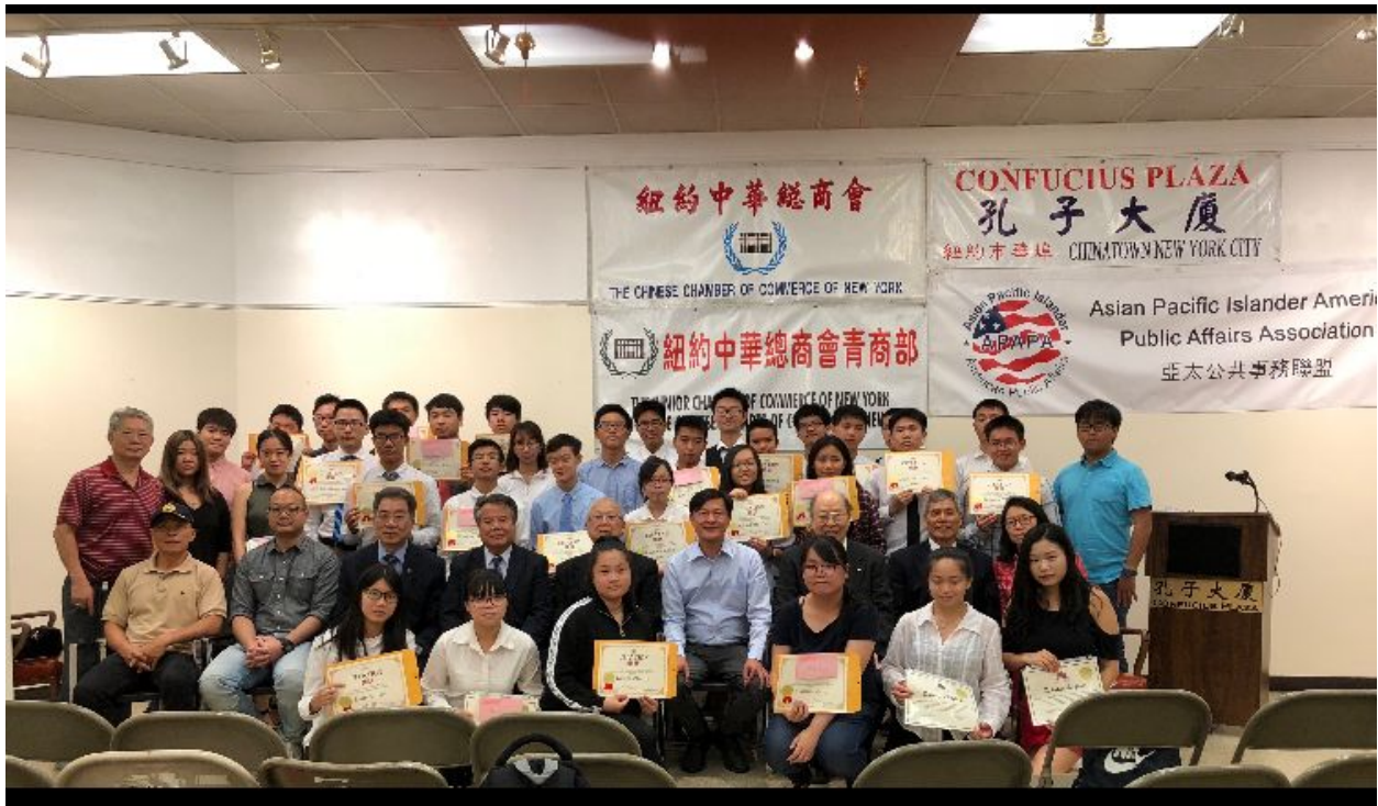
At the summer high school interns' graduation